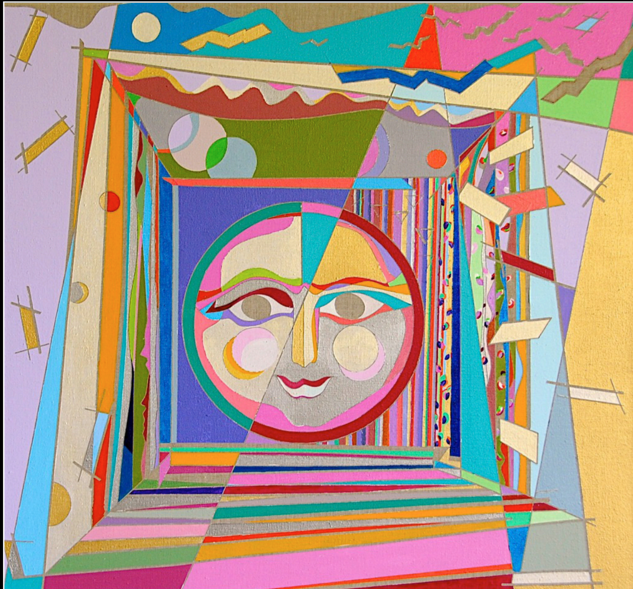
“Sing to the Carnival Moon” Acrylic on Canvas 30” x 32”