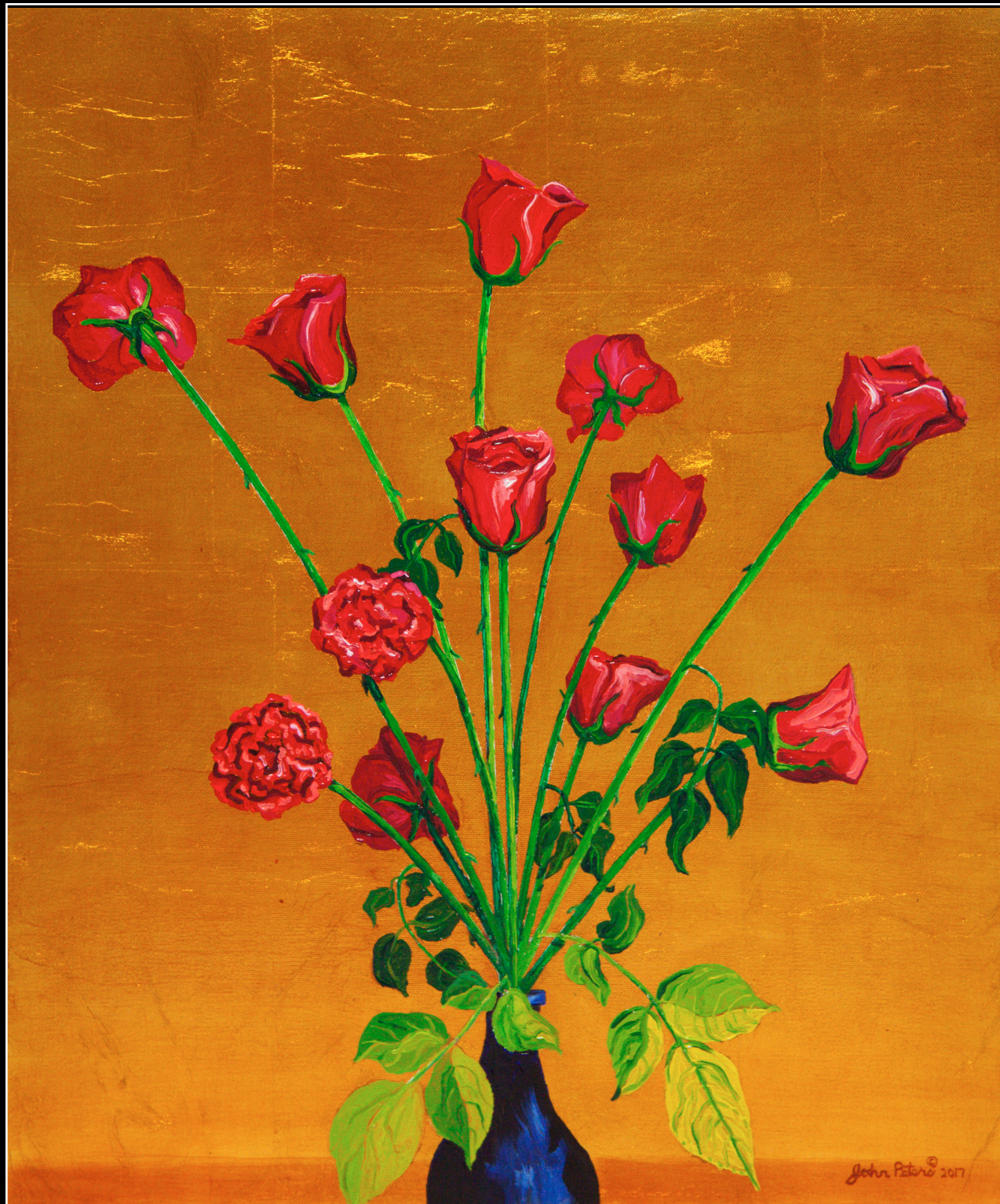
“Bouquet of Rubies” Metal Leaf, Oil on Canvas 24” x 20”