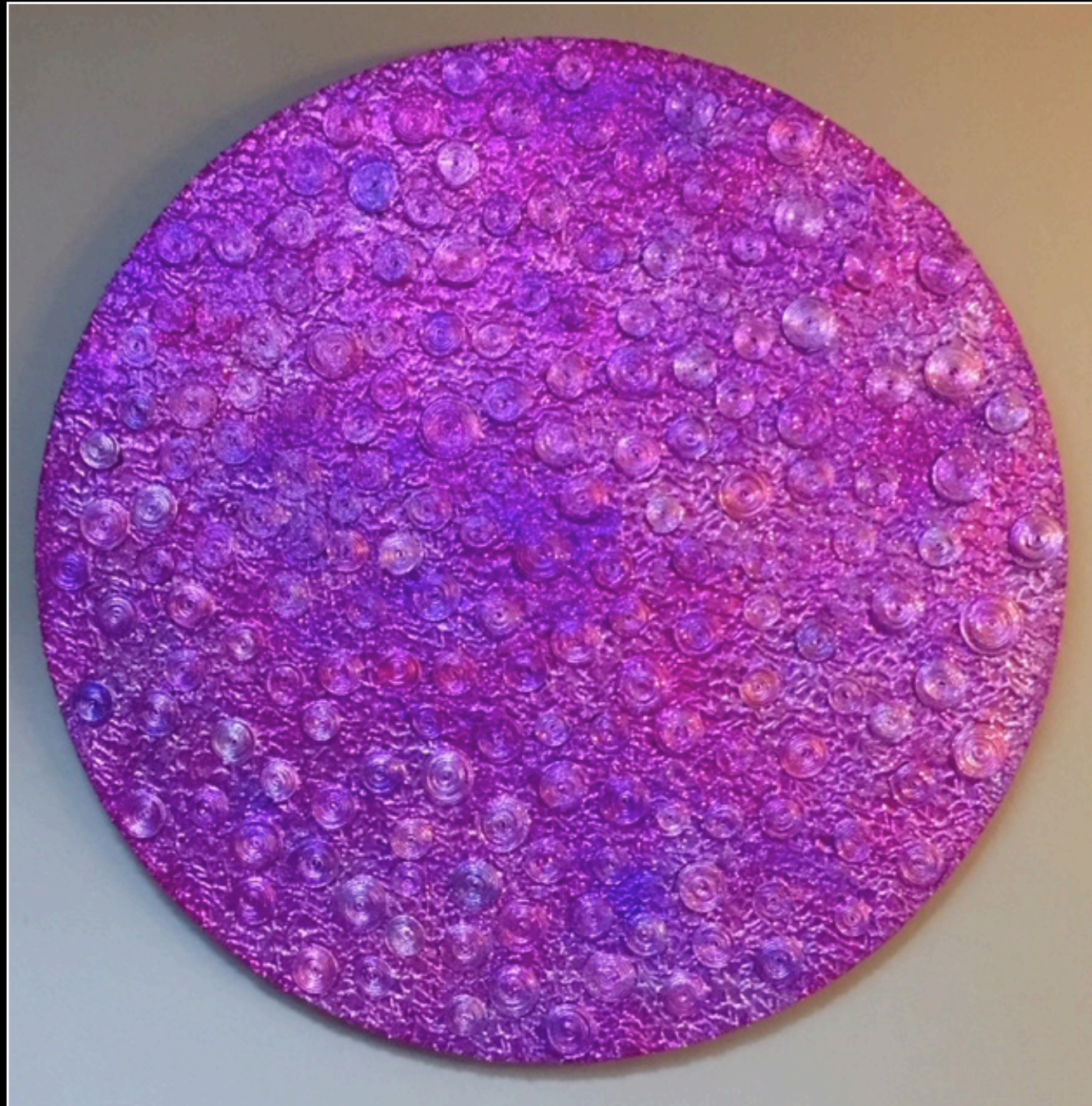
“Spirale Rose en Mauve (Pink Spiral in Mauve)”