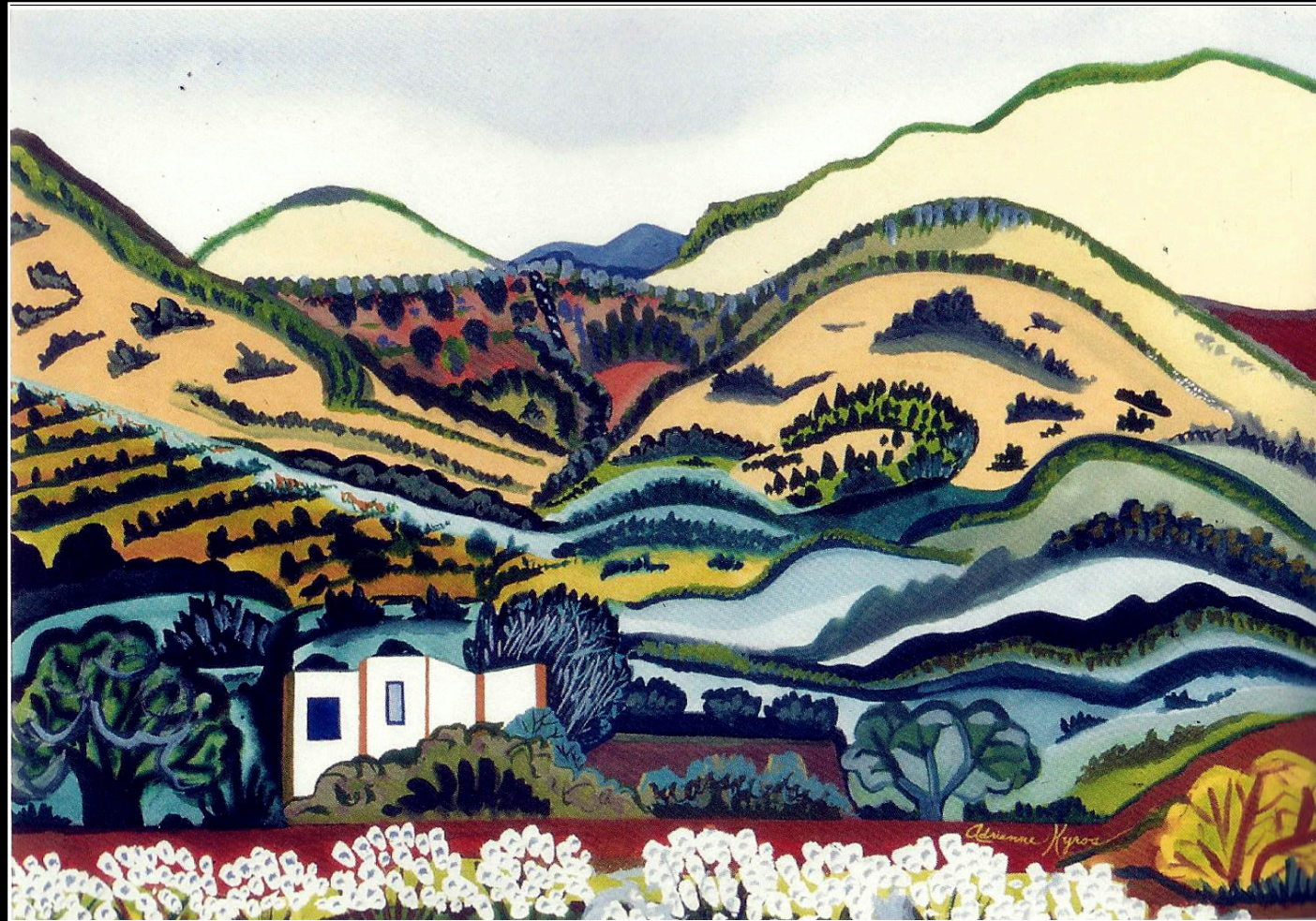
“Aegali Hills, Amorgos Greece”