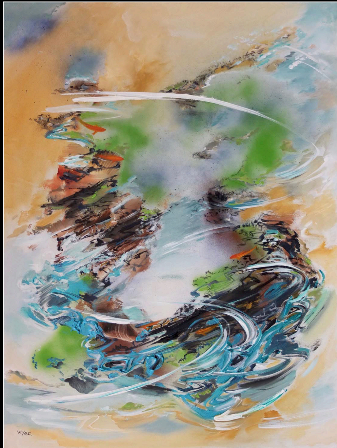
“Ebb Tide” Acrylic on Canvas 40” x 30”