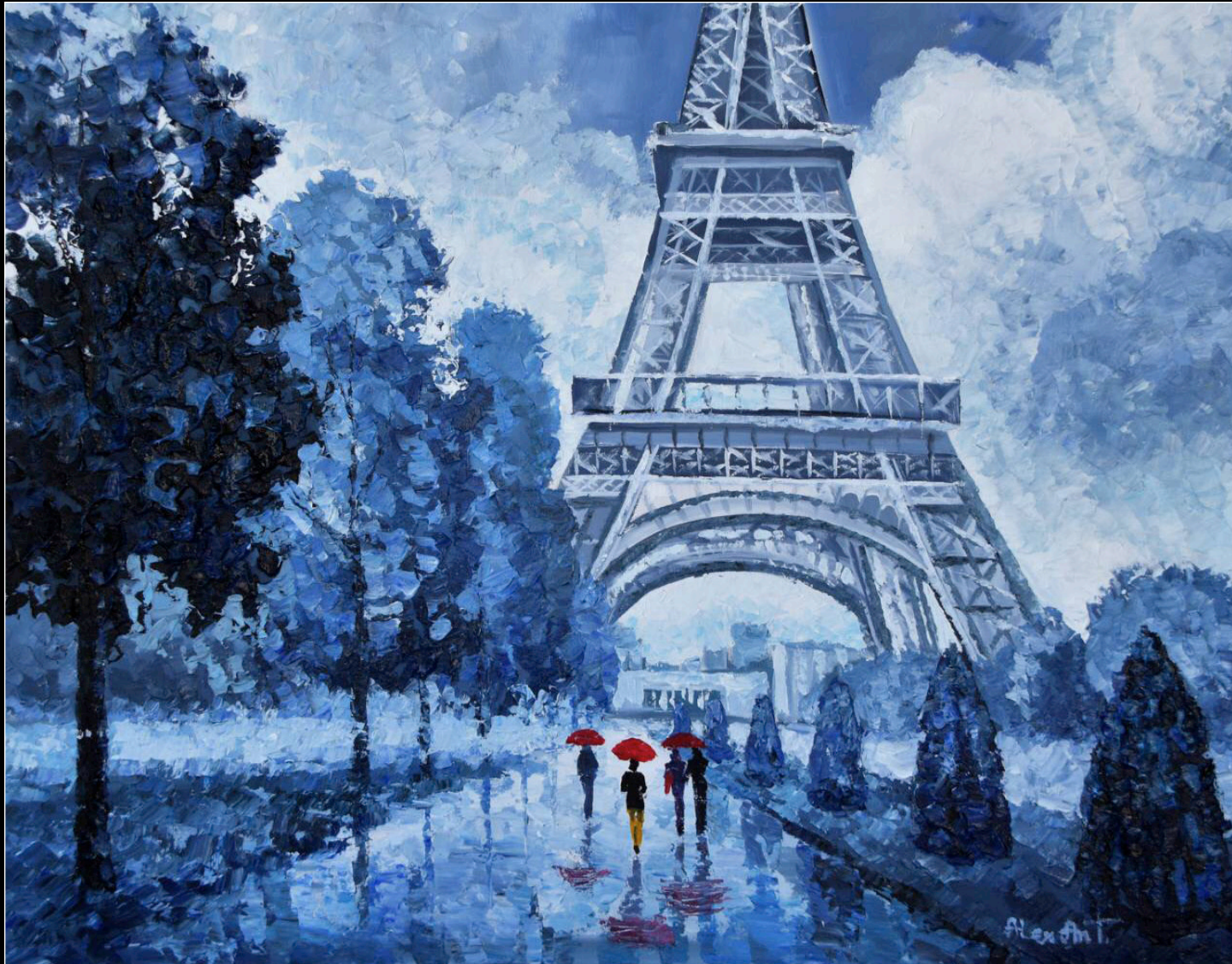
“One Fine Day” Acrylic on Canvas 24” x 36”