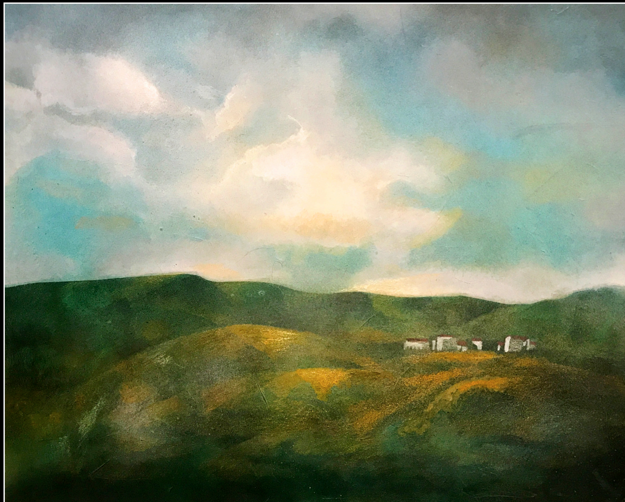
“Toscana Landscape #1”