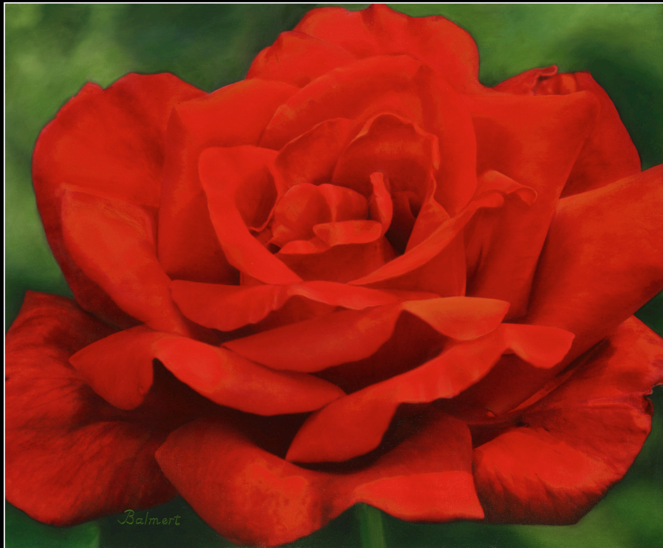
“Mr. Lincoln Rose” Oil on Linen 20” x 24”