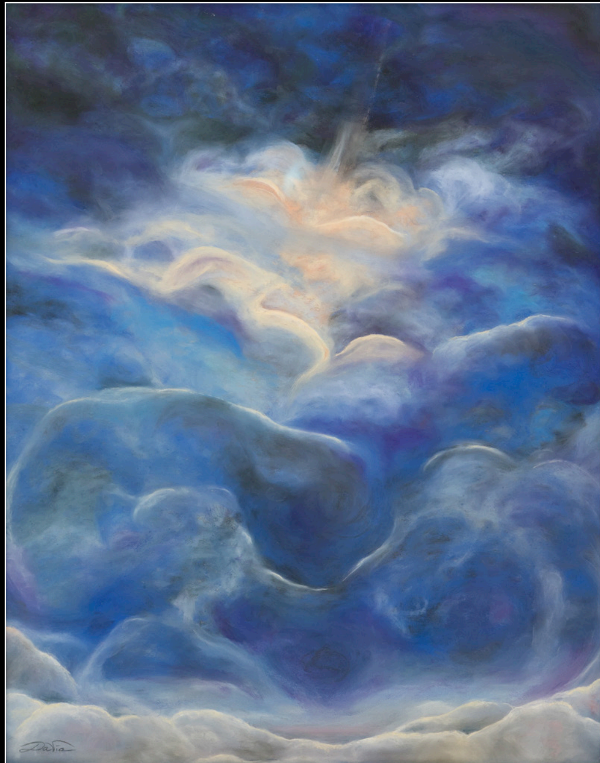
“Beyond” Pastel 21” x 27”