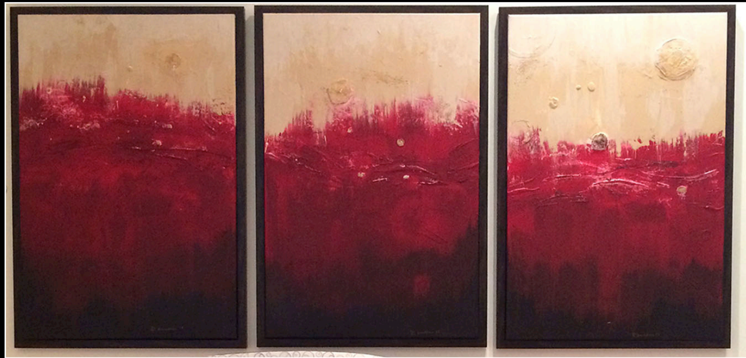
“Red Wall” Sand, Acrylic, Plaster 35” x 75”