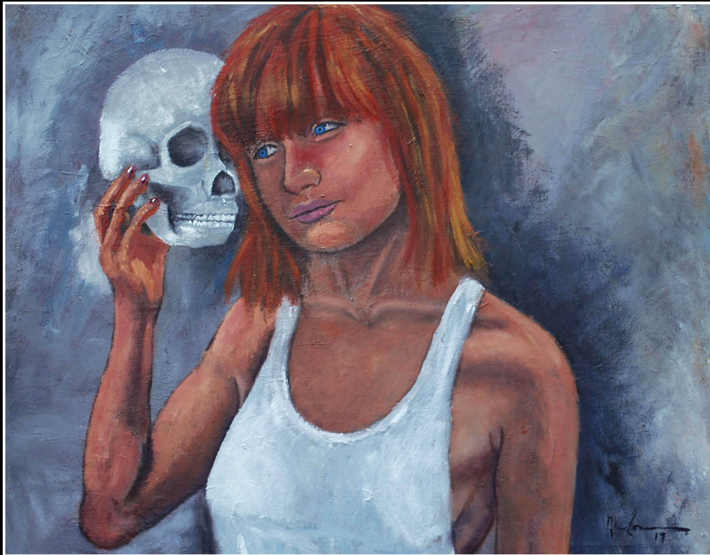
“Whispers” Oil on Canvas 28” x 32”