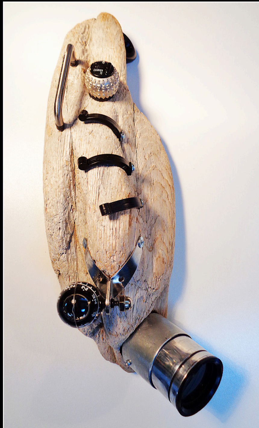
“Courrier Wild” Repurposed Material Embedded in Drift Wood 16.5” x 6” x 5”