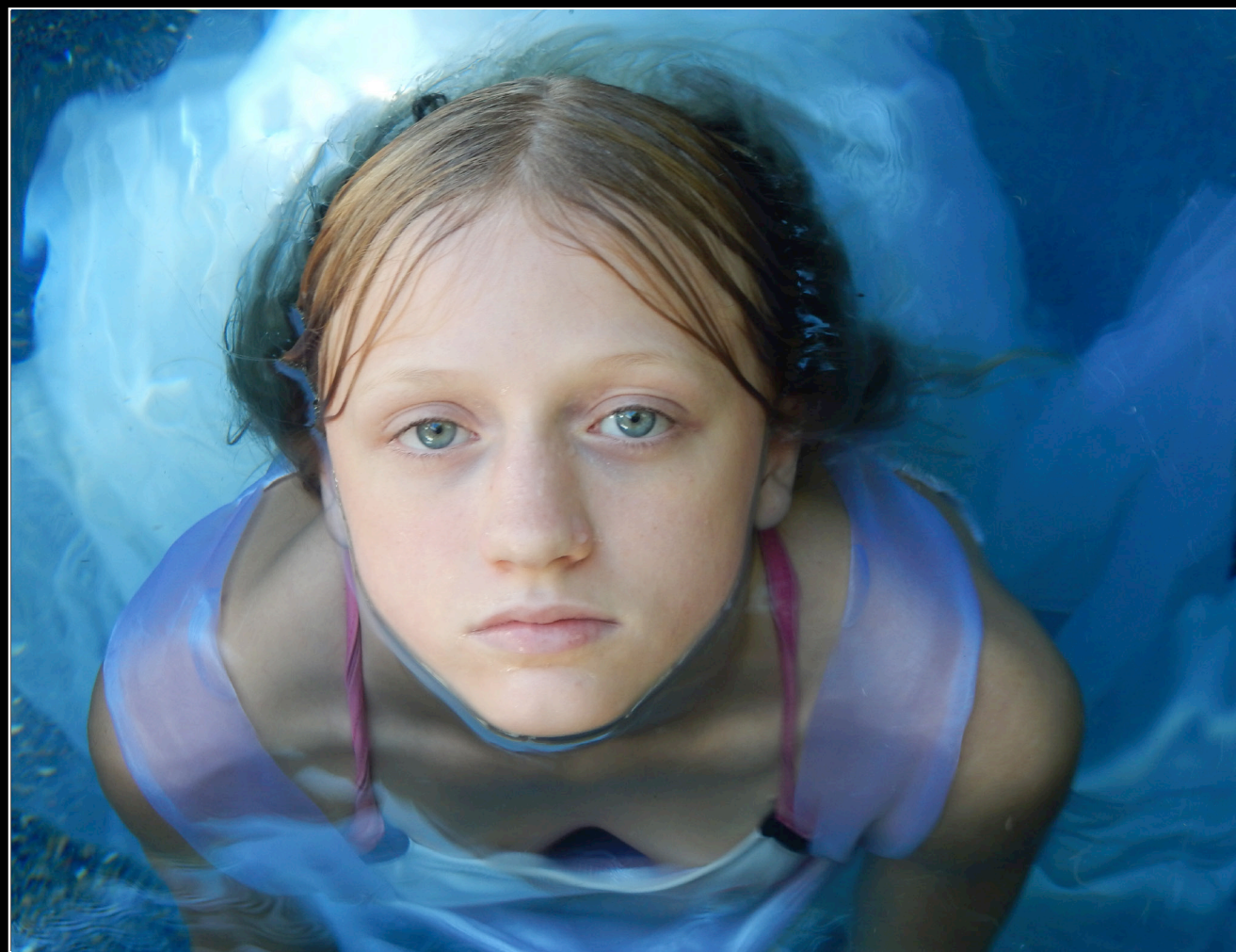
“The True Face of an Angel” Liquid Gloss on Dibond 22” x 29.5”